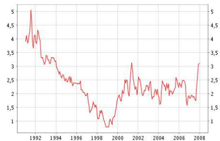
Figure 1 : European HICP overall index monthly variations